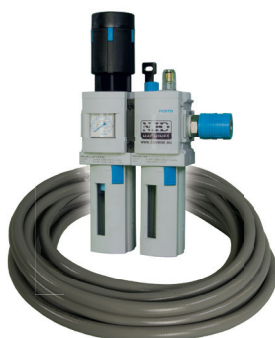
Art. Nr. 27221