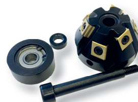
Art. Nr. 27223