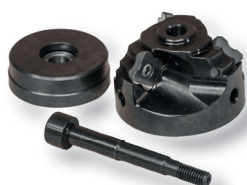
Art. Nr. 27234