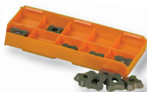
Art. Nr. 26109