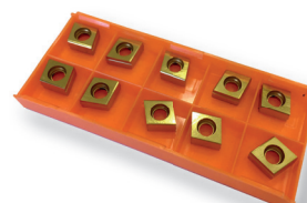
Art. Nr. 27231